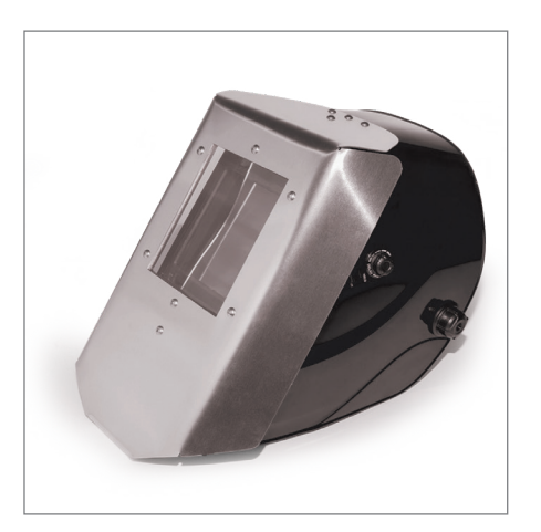
Helmet with Safety Window Laser safety helmet with Class IV protection