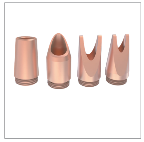
Highest grade copper nozzles with precision