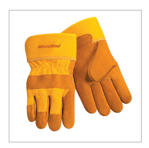
Top-grain leather gloves with the highest safety grade