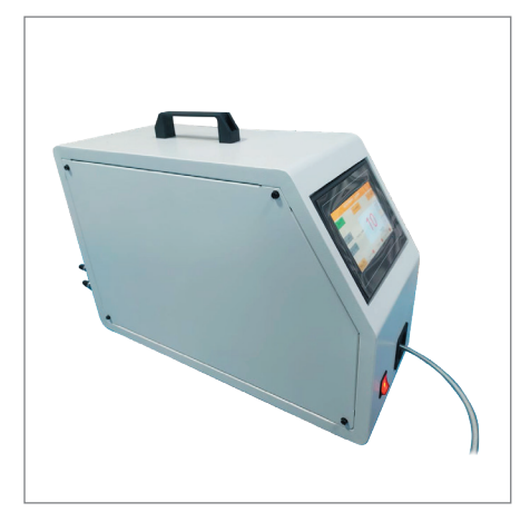
Wire Feeder Programmable wire feeder