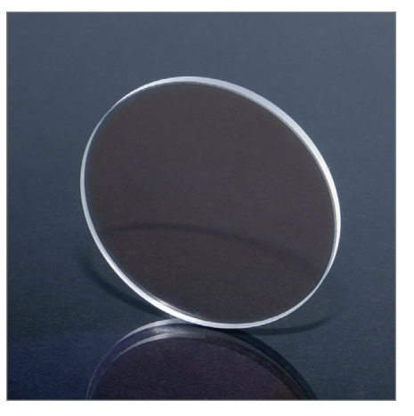
Handheld gun protection window