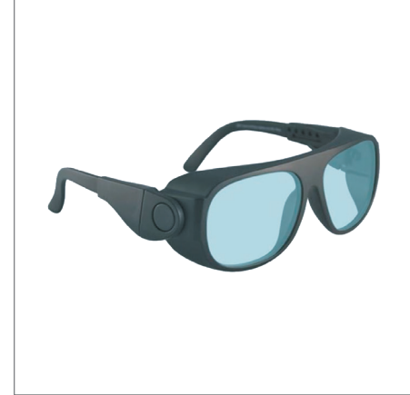
Laser safety goggles with Class IV protection