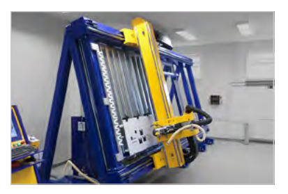
Organize your production efficiently with a floor space saving solution - the vertical router MicroMill-V. While preserving the dynamics of a standard MicroMill machine, the easily accessible work area of MicroMill-V enables convenient loading and unloading of material.