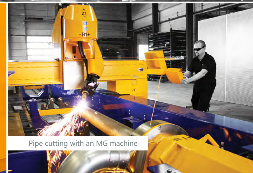
Pipe cutting with an MG machine