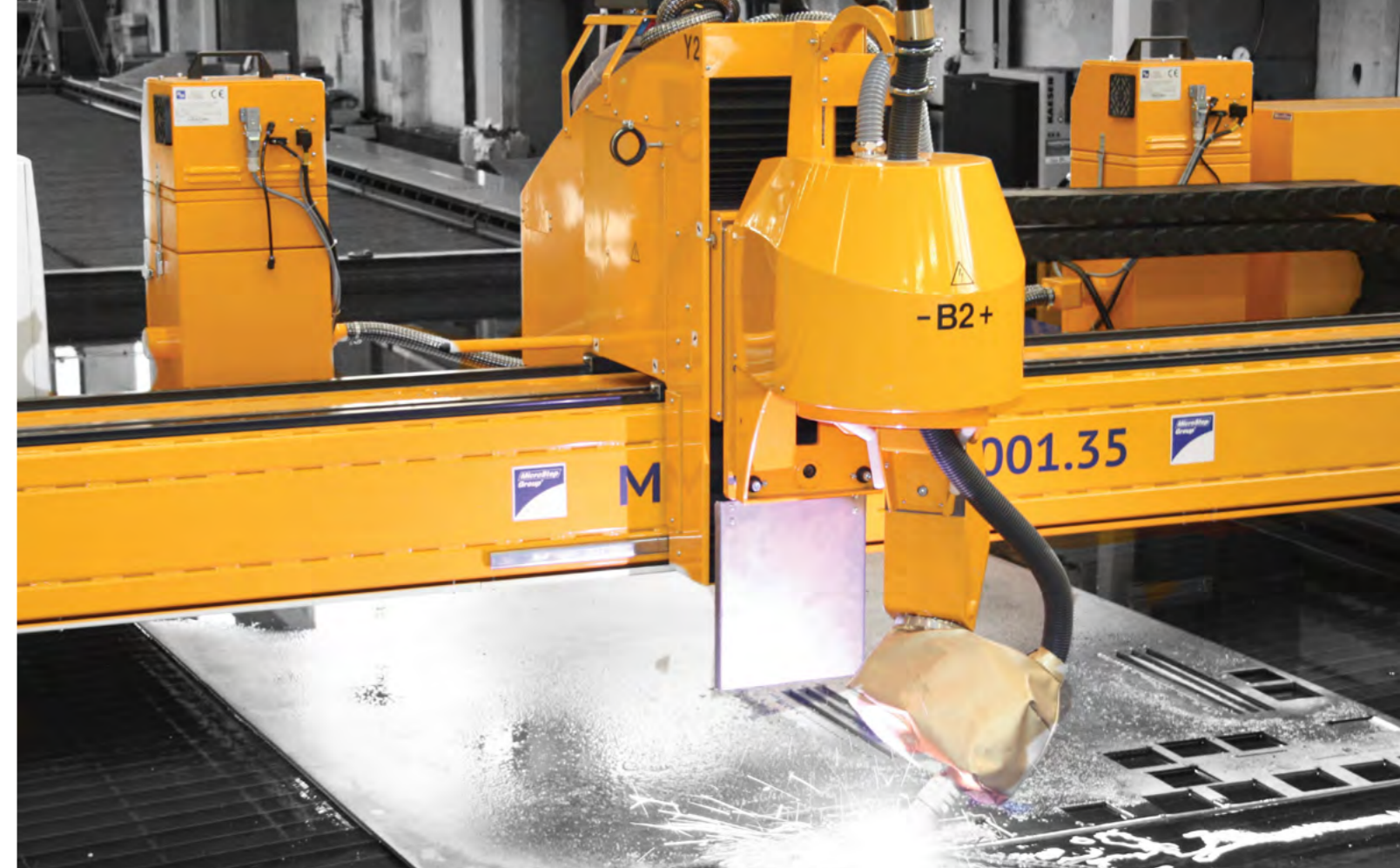
Plasma rotator performing bevel cutting on a water table

The sturdy machine frame and gantry construction of MG series enables dome processing up to Ø 4,000 mm. Different types of tool stations provide a different extent of reach over the dome surface and thus offer various dome processing options.