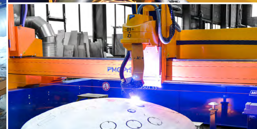
Dome processing with a multi-functional MG cutting machine