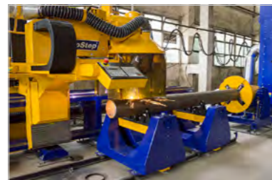
Efficient suction through chuck and the overhead extraction system

MicroStep's proven suction design for pipe cutting includes direct fume extraction from inside of the pipe through chuck as well as suction from the overhead cover around the cutting head.