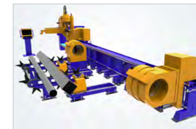
Automatic loading, feeding and unloading

The PipeCut series can be fully automated via handling systems and CyberFab® Manager software, including: