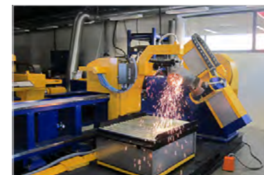
ElbowCut: Weld edge preparation on pipe elbows

ElbowCut, a special version of the PipeCut machine, was designed for trimming of pipe elbows with preparation of trimmed edges for subsequent welding. The machine can process elbows in the range Ø 80 – 400 mm while ensuring high environmental safety and suction efficiency thanks to housing in a noise reducing cabin*.