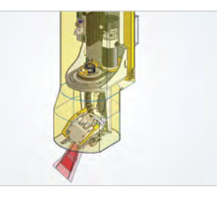
ProfileCut machines are equipped with a 3D laser scanner that measures the exact shape of beam in the place of cutting. Advanced algorithms then allow the control system to adjust the movement of tool accordingly and compensate for possible inaccuracies of the particular beam.

Laser scanner for measuring of the true beam shape