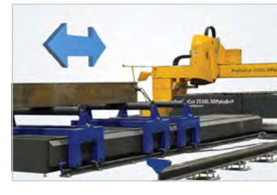
Thanks to the large, open loading area, even heavy beams can be easily and safely slid over the supporting rollers into the work zone. This saves time as the beams do not have to be clamped or otherwise prepared for processing.